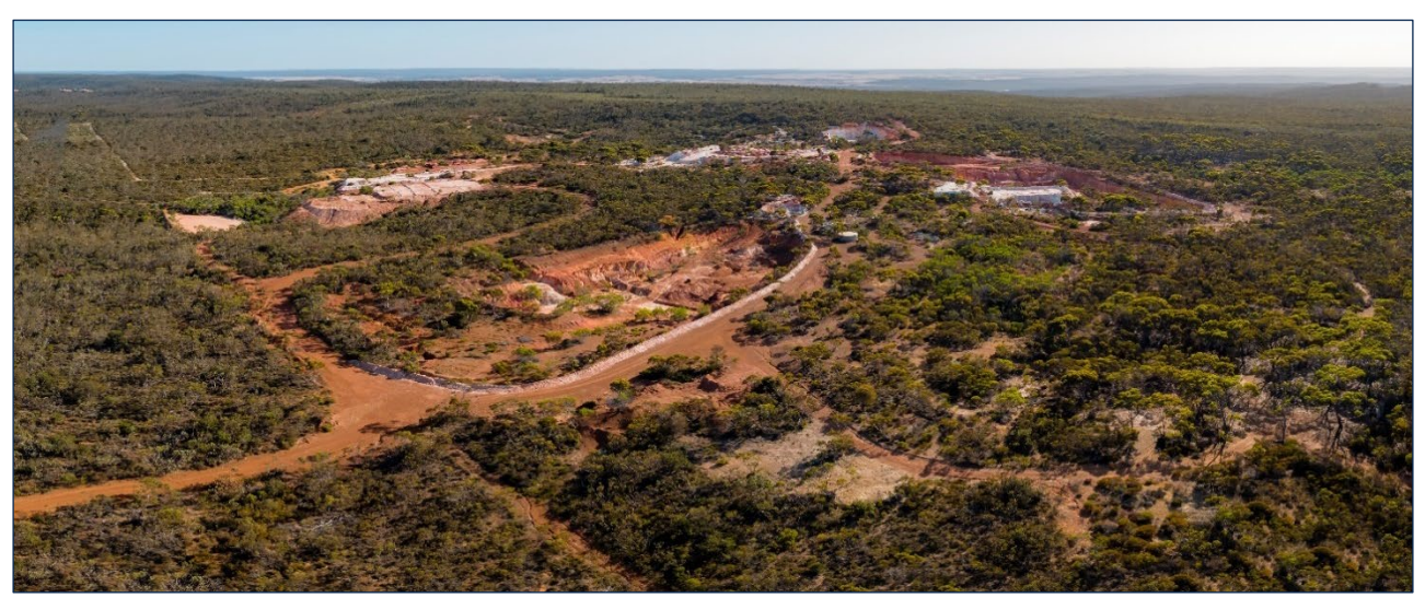
Figure 2: Historical workings at Western Gem (foreground), Two Boys (centre right) and Kaolin (top); view to the northeast