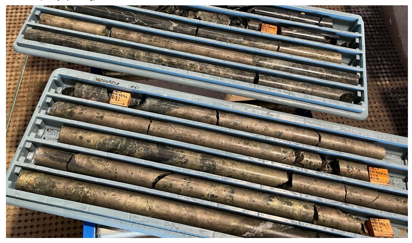
Figure 5: DD24KP1232 displaying semi massive to massive pyrrhotite-chalcopyrite mineralisation from approximately 353m downhole (assays pending).