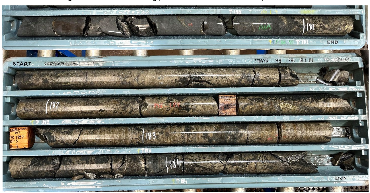
Figure 4: DD24KPMET003 displaying semi massive to massive pyrite-chalcopyrite mineralisation from approximately 181m downhole (assays pending).

Given the potential upside the new sulphide lodes represent, the Company is carefully evaluating next steps. These include drilling new holes and extending proximal holes to the new lode positions.