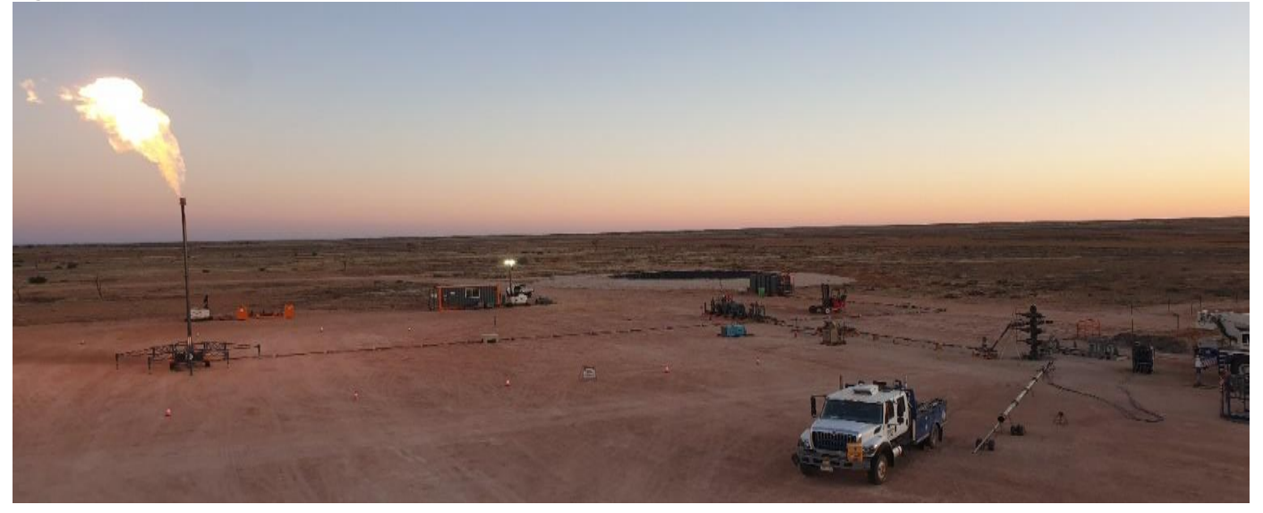
Figure 2: Well Test on Odin-1