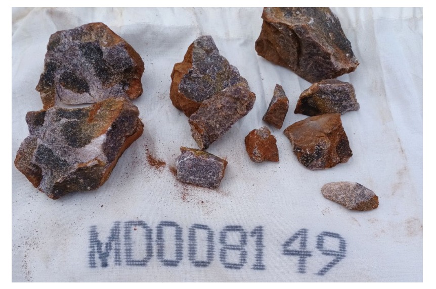
Figure 3: Apparent Siliceous Lepidolite, Kawana North Prospect