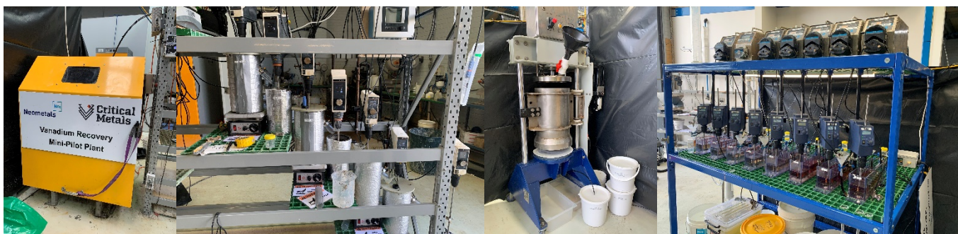
Figure 1 - Selected images of the mini-pilot plant including (from left to right): the rod mill, the integrated leach and regrind circuit, the pressure filter, and the solvent extraction circuit