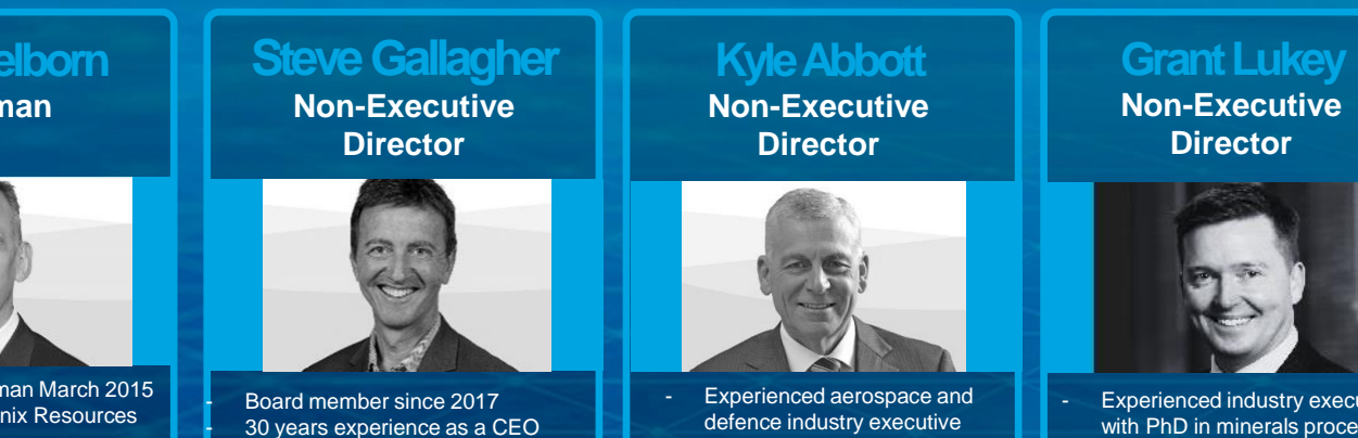
Experienced industry executive with PhD in minerals processing CEO & MD of Coogee Chemicals