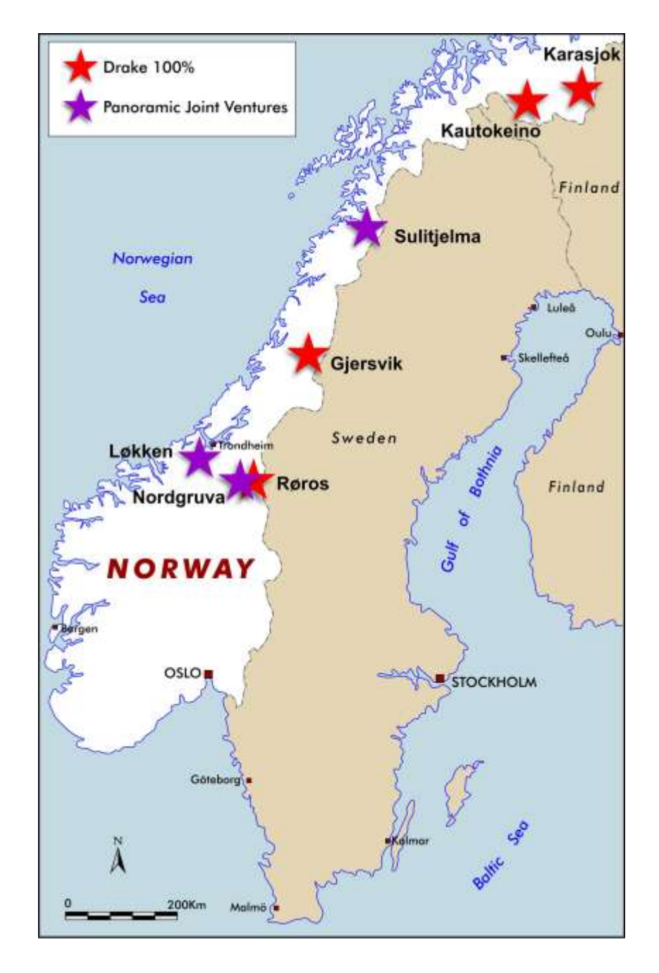
Drake's Norway projects