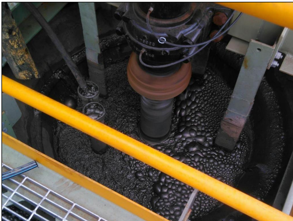
Photo 4 - Flotation cells in operation