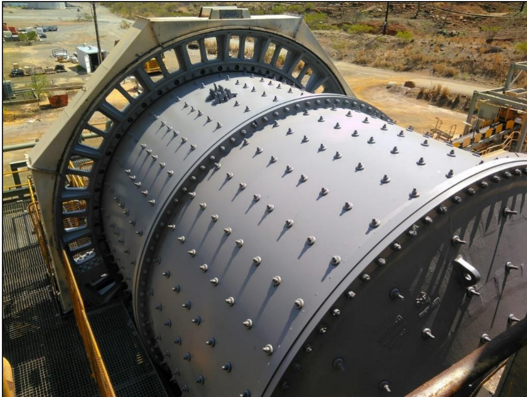
Photo 2 - SAG Mill