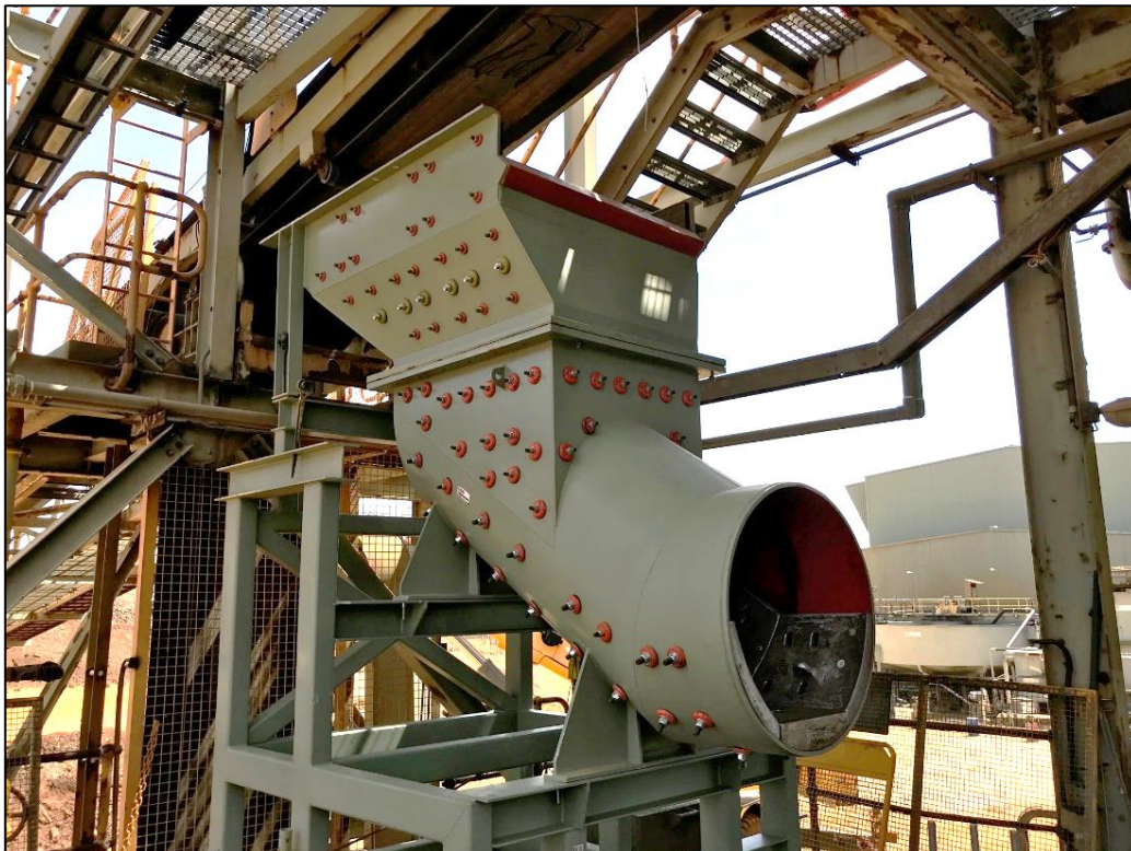
Photo 3 - New SAG mill feed chute