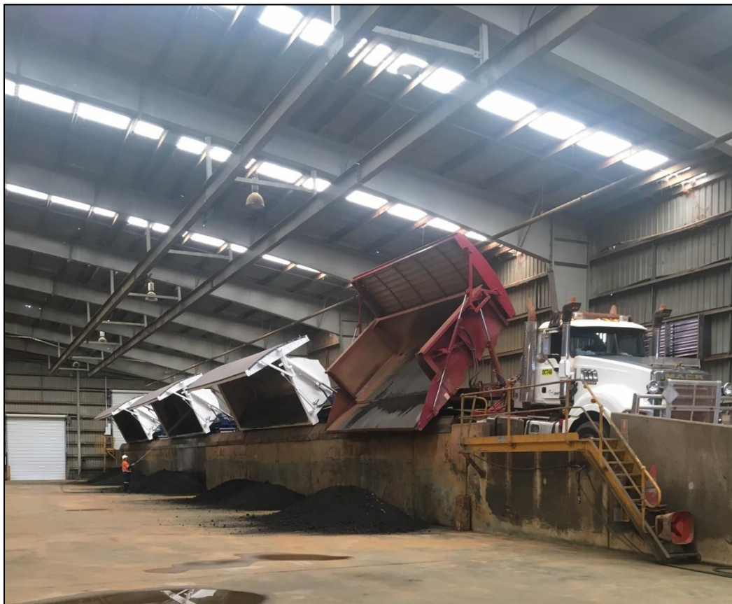
Photo 8 - Savannah concentrate being unloaded at the port shed in Wyndham

The Company has booked a concentrate shipment and the vessel is currently scheduled to be in Wyndham in early February to load between 5,000-8,000wmt of Savannah concentrate. The trucking of concentrate from Savannah to Wyndham using Company owned and operated prime movers and trailers has commenced.