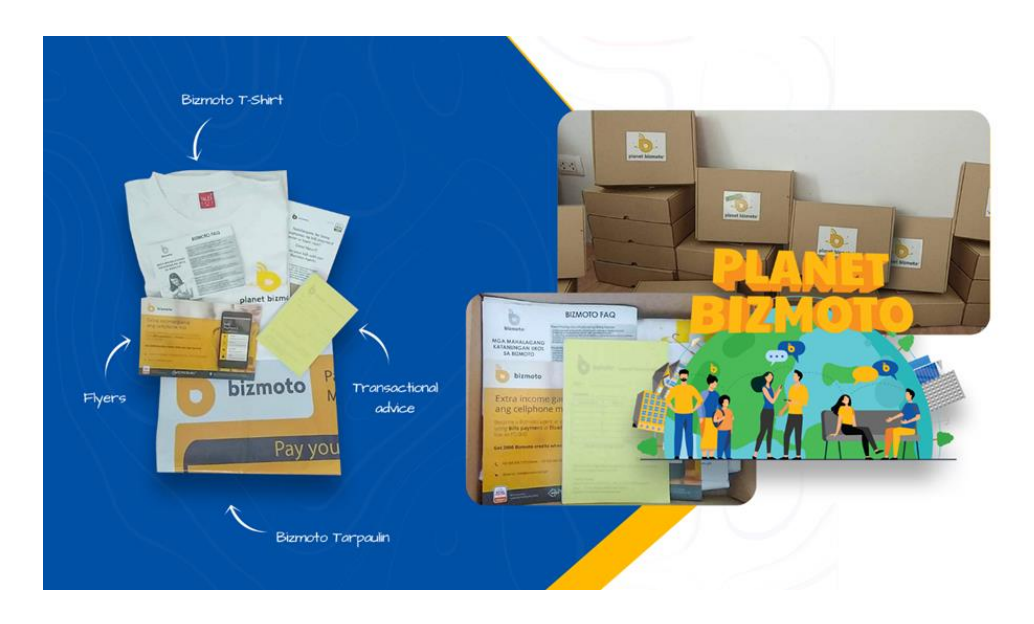
Examples of bizmoto's target marketing campaign (above and below)