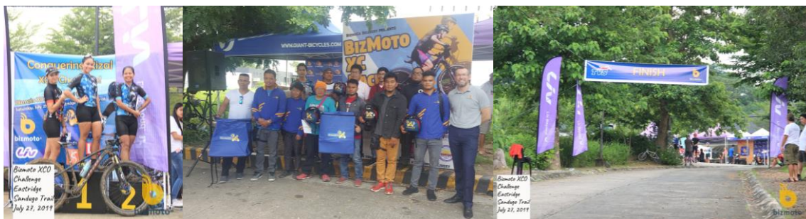
BizmoGo launches in Novaliches and Antipolo

The BizmoGo Delivers program provides registered riders with accreditation and training on how to build their own micro-business combining the Bizmoto mobile app (powered by Peppermint) and a motorcycle, allowing them to deliver various products and services to Filipino people. To the end of June, almost 100 merchants had subscribed to use the BizmoGo Delivers program, offering mobile bill payments, mobile eLoad and money transfers as well as deliveries of food, rice, bottled water, LPG cylinders and other general store merchandise from small businesses.