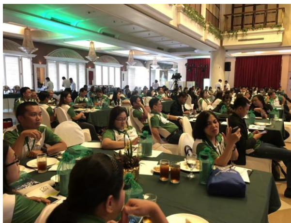
Members undertake training for the new Peppermint-developed mobile App at the general assembly of the Cooperative Health Management Federation (CHMF)

The first phase of the mobile app allows CHMF's 41,088 members to locate accredited medical centers, make appointments and review all of their medical insurance history online. The second phase will include functionality for a mobile wallet, QR code payments, member to member payments and other transactional capabilities.