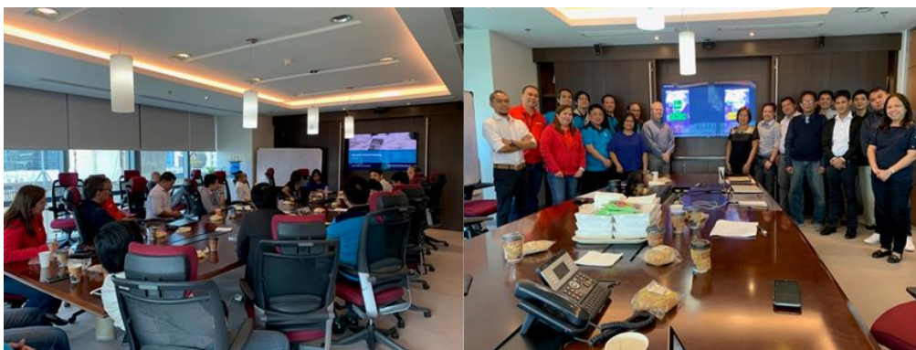
BancNet Peppermint ‘Kick-Off’ meetings June 2019

During the June Quarter, Peppermint held project “kick-off” meetings with three Outsourcing Banks, including the Bank of Makati (ranked 8th among the top thrift banks with 19 branches, 24 loan centers, and 13 microfinance-orientated branches); UCPB Savings Bank (ranked 9th among the top thrift banks with 49 branches, 13 lending offices and soon 14 branch lite units) and Partner Rural Bank (Cotabato) (which has been operating for more than 40 years providing countryside agricultural assistance in Mindanao).