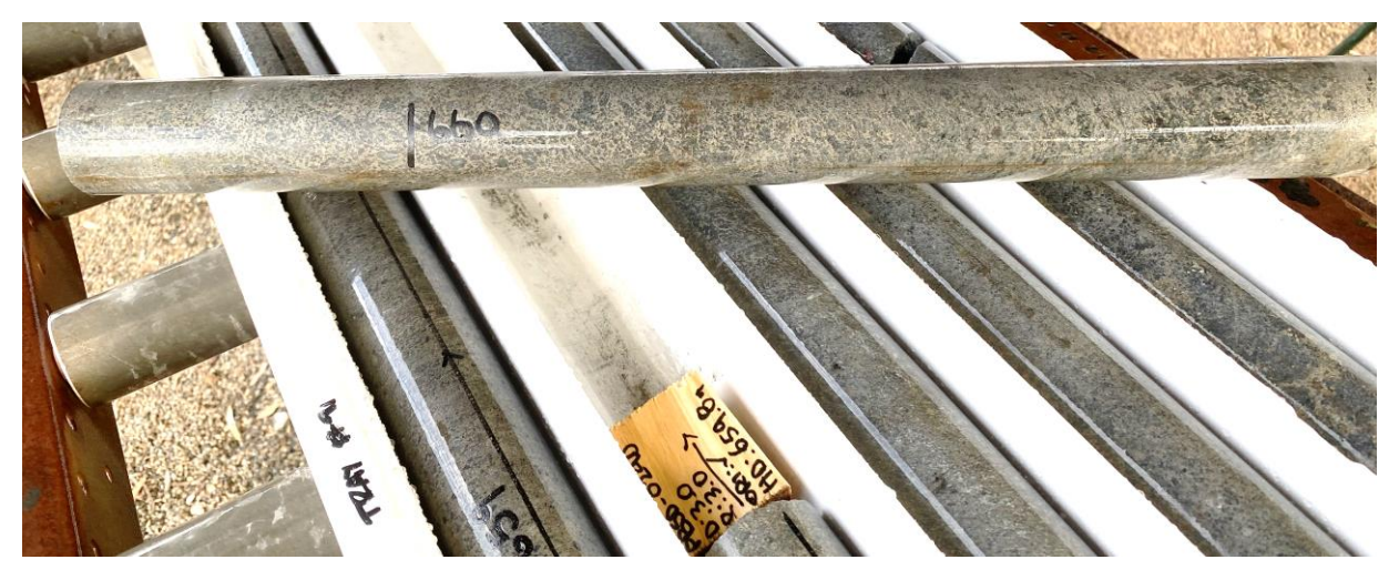
FIGURE 3 - NET-TEXTURED MATRIX NICKEL SULPHIDES WITHIN THE BLACK SWAN MINERALISED FLOW UNIT