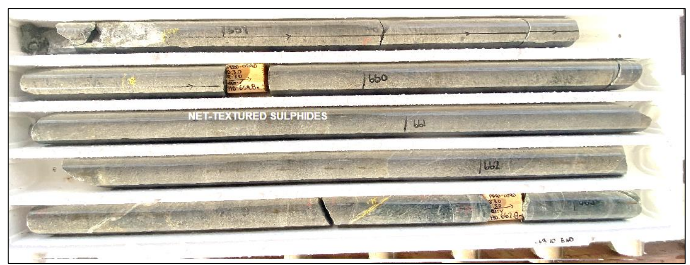
FIGURE 2 - LATEST GOLDEN SWAN SULPHIDE INTERSECTION IN HOLE PBSD0029D

All significant intersections for the Golden Swan drill program are shown in Table 2. The thickness and high grade of all intersections achieved to date demonstrate the significance of the Golden Swan discovery. Hole PBSD0029D may also indicate that the previously identified, separate DHEM plates outlining the known Golden Swan mineralisation are a continuous horizon of nickel sulphides accumulating upon the Southern Terrace.