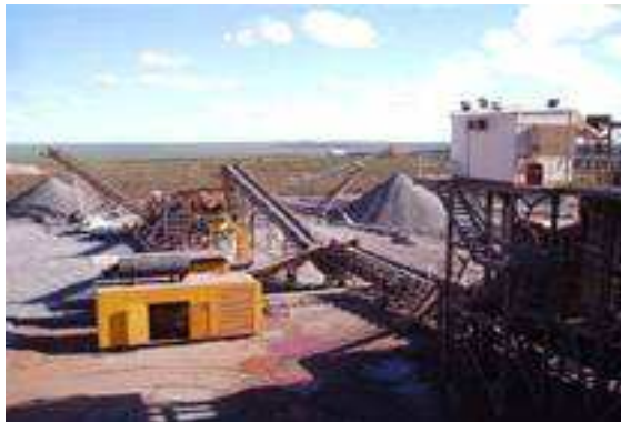
Crushing & Screening (build, own, operate)