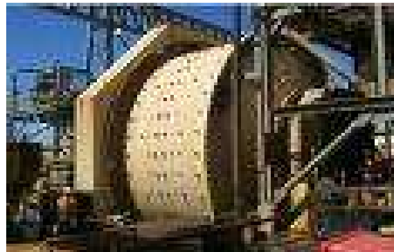
Milling at 300kT p.a.