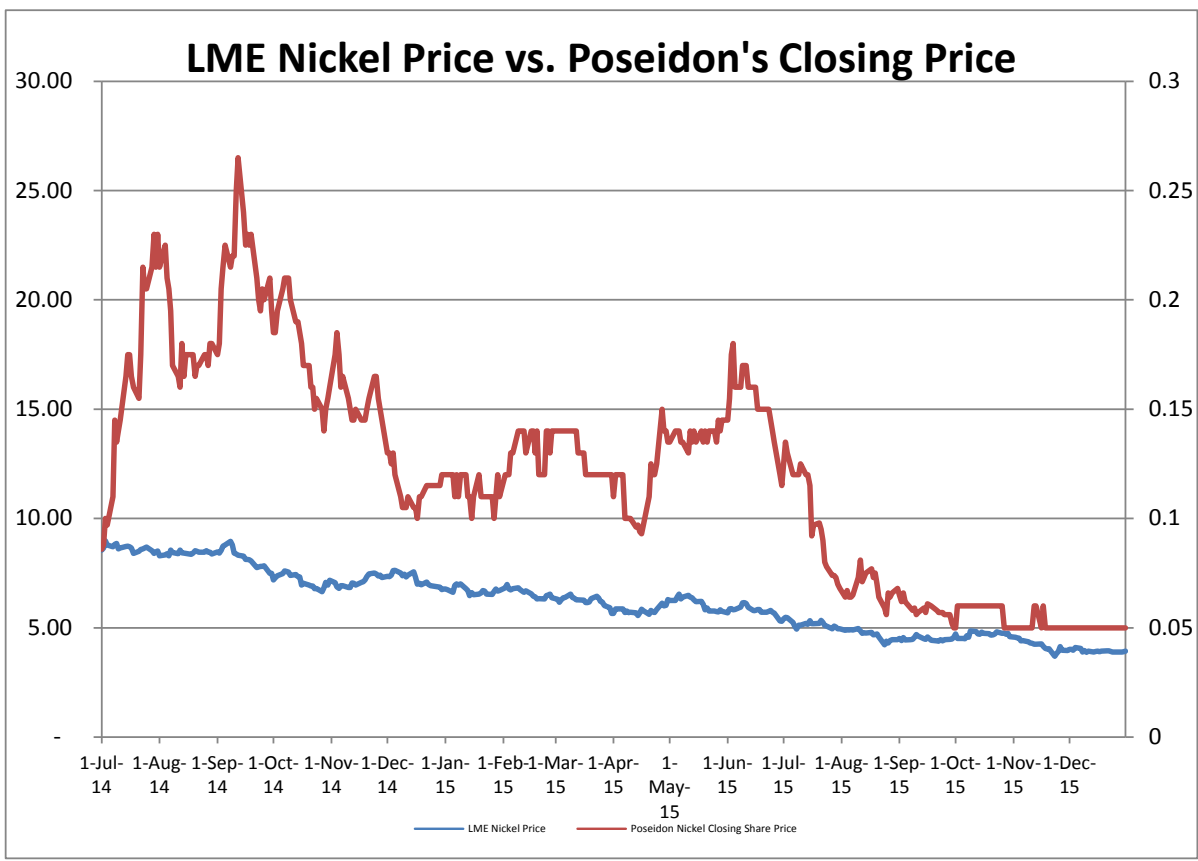
Figure 4: Poseidon share price graph compared to LME Nickel price

Figure 4 below shows the underlying correlation between Poseidon's share price and the LME Nickel price over the last 18 months.