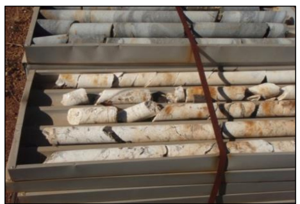
Figure 5: The core yard holds many trays containing thick intersections of unsampled pegmatites (white rocks) as they have always been considered barren waste rock until the significance of these potential lithium-tantalum bearing pegmatites were recently recognised