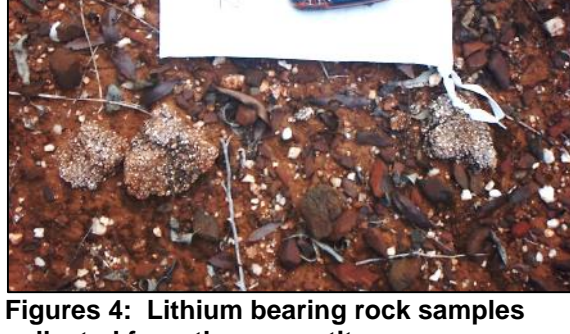
collected from the pegmatites