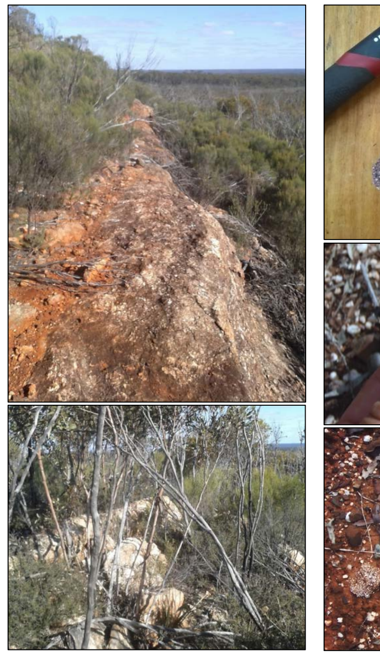
Figures 3: Outcropping pegmatites within E63/1067