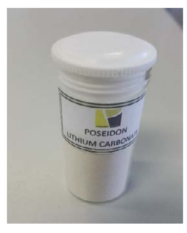
Figure 5: Lithium Carbonate Produced