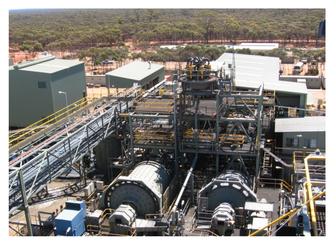
Figure 4: Spare Milling and Flotation Capacity at Lake Johnston

Preliminary discussions with possible third party offtake providers for a 5 to 6% spodumene concentrate and tantalite concentrate have progressed to explore the likely terms offered. The offtake providers are interested in forecast quality and volume to establish an offtake framework. The forecast quality and deleterious elements will be investigated from testwork completed from ores recovered from trenching at Lake Johnston. The volume to be delivered to market will depend on the successful resource definition of a spodumene corridor at Lake Johnston and the existing concentrator secondary circuit capability as determined by Primero Group Engineers.