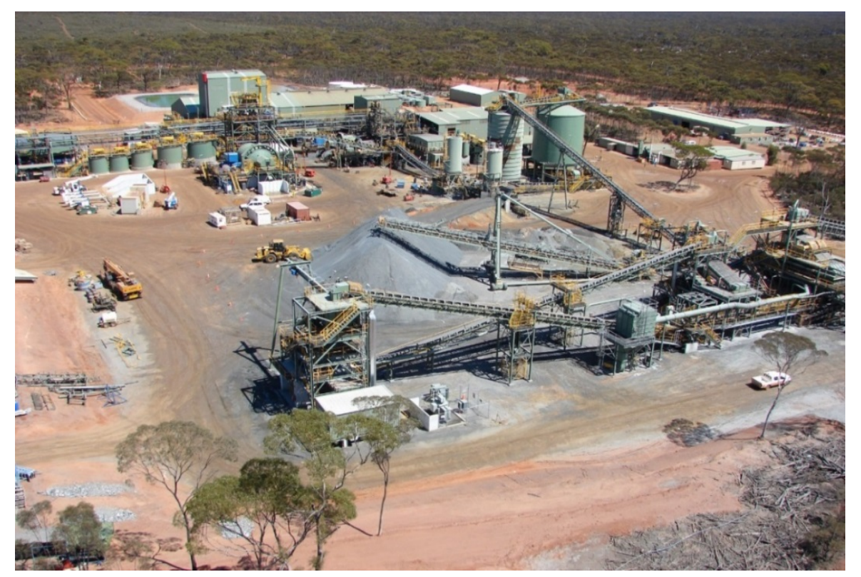
Figure 3: Lake Johnston 1.5MTPA Concentrator

A research and development programme will be progressed based on bulk metallurgical samples recovered from pegmatite trenching. The testwork will include uniaxial compressive strength of typical rocks, Bond impact crushing and abrasion tests, some heavy media separation research using spirals, flotation optimisation, thickening and filtration testwork as well as tantalite recovery. Following the initial laboratory testwork, Poseidon plans to move to a plant trial to investigate the production of a spodumene concentrate at the Lake Johnston concentrator (Figure 3).