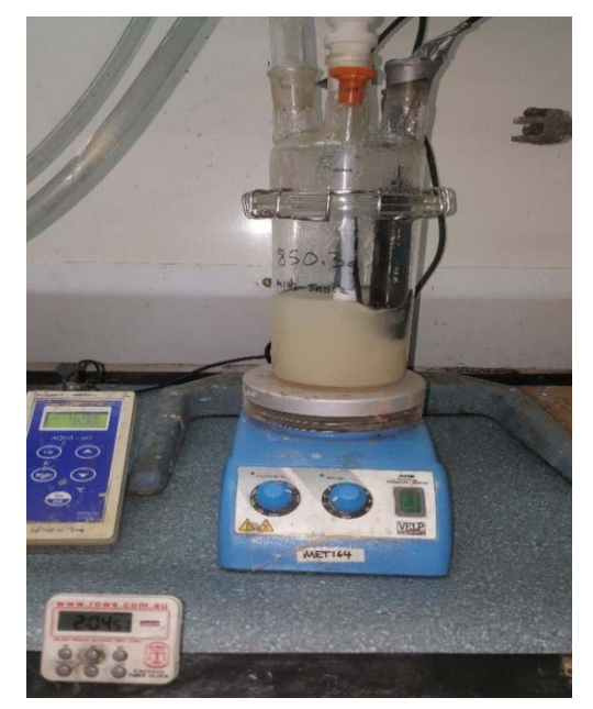
Figure 6: Lithium Hosted Pegmatite Leaching Research Equipment