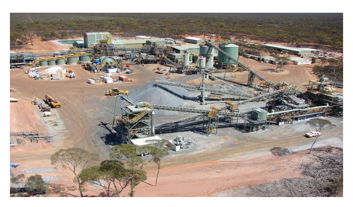
Figure 1: Poseidon Nickel's Lake Johnston concentrator.

Additional infrastructure at Lake Johnston includes existing tailings disposal cells, a bore field and water treatment plant, large mine workshop and maintenance facilities, administration buildings, functional laboratory and metallurgical laboratory, plant stores and workshop areas, medical centre and emergency response control centre. The site power is supplied by a local power station.