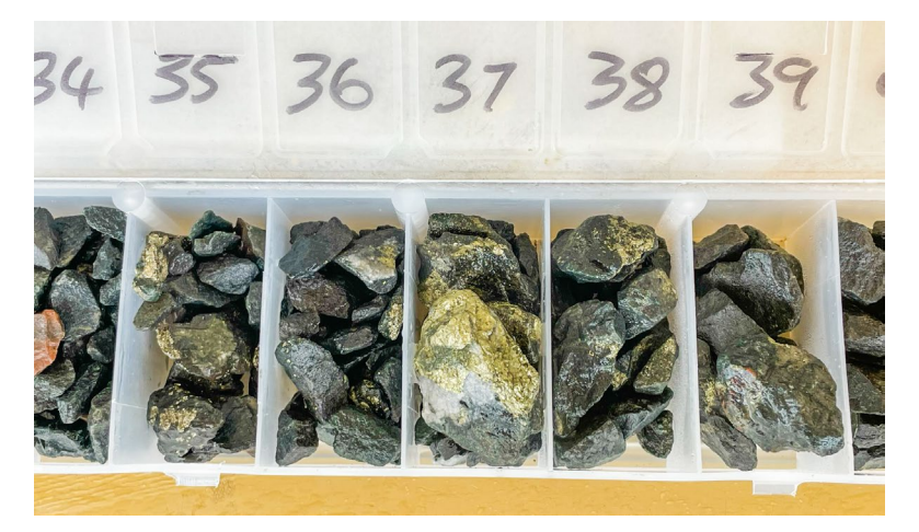
Figure 2. Chalcopyrite-pyrite sulphide zones at Mongoose - Hole RMG015.<sup>1</sup>