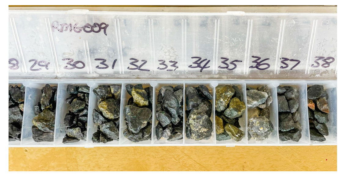
Figure 3. Chalcopyrite-pyrite sulphide zones at Mongoose – Hole RMG009<sup>3</sup>