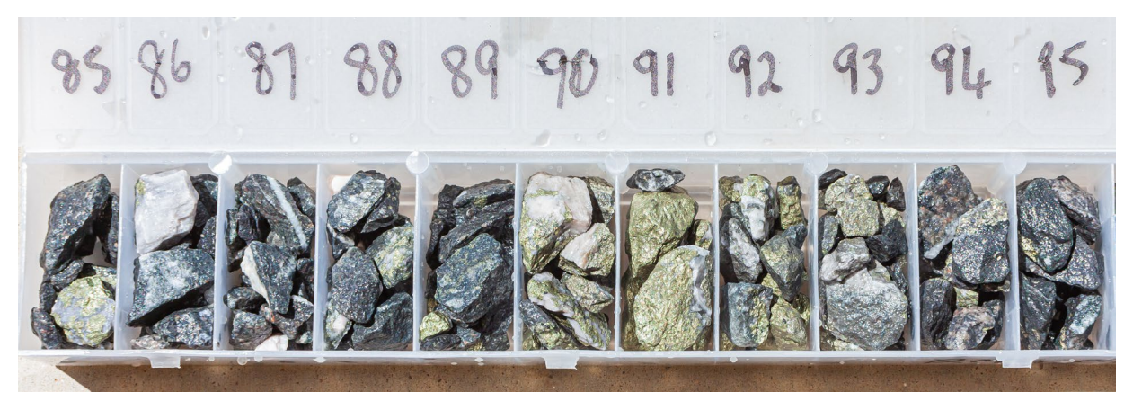
Figure 1. Chalcopyrite-pyrite sulphide zones at Mongoose - Hole RMG021.<sup>1</sup>