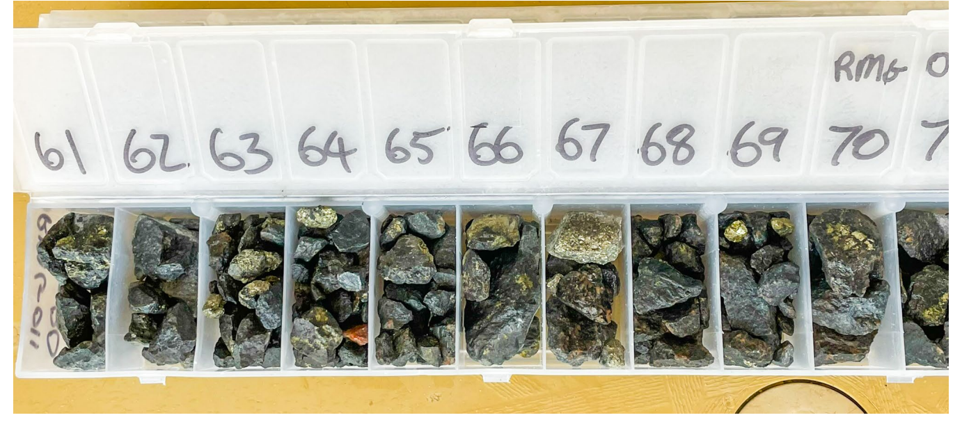
Figure 4. Chalcopyrite-pyrite sulphide zones at Mongoose - Hole RMG011<sup>3</sup>

Mongoose is part of the Carpentaria Joint Venture (CJV) between Glencore plc and Renegade, whose stake is currently 23.03%. In January 2023, Renegade reached agreement with Glencore to excise the Mongoose Project (EPM8588) and sole risk future expenditure. Renegade's interest in EPM8588 will increase with expenditure<sup>4</sup>.