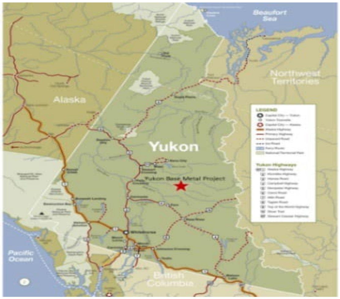
Figure 1. Yukon Base Metal Project location map

Renegade believes that there is potential to increase the resource base at the Yukon Base Metal Project. Mineralisation remains open at depth and along strike at the Andrew, Darcy and Darin Deposits.