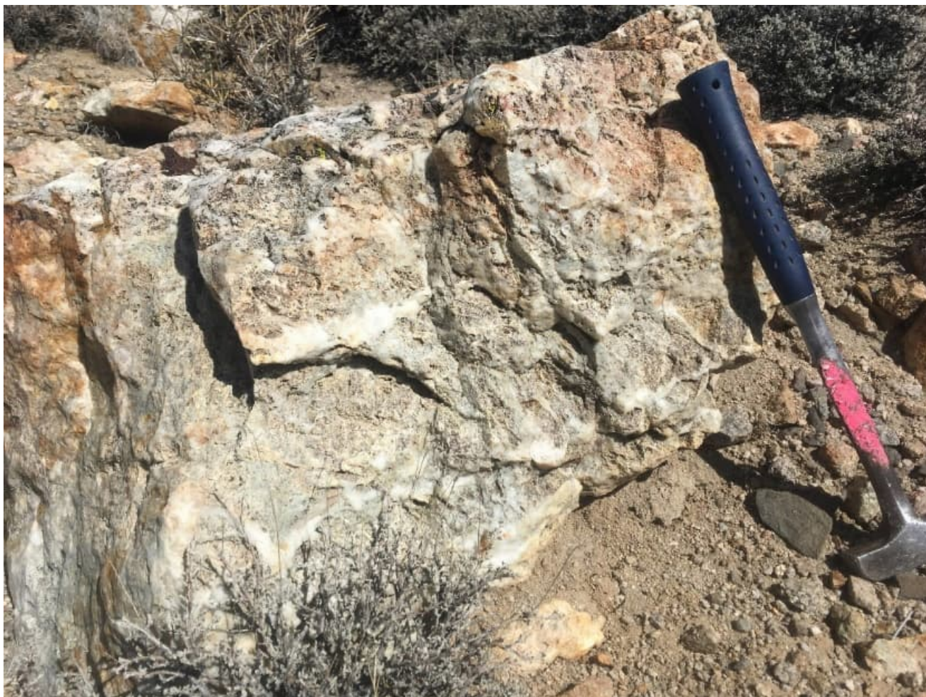
Figure 3. Photo of quartz veins in shear zones at Caisson Project 3 .

There is some historical work on some of the projects including mapping, soil and rock chip sampling, plus some limited drilling on three of the projects. All of the projects are regarded as highly prospective and require further detailed geological work and drilling.