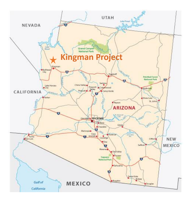
Map 1 - Location of Riedel's Kingman project in Arizona, USA

The Kingman Project is located in north-west Arizona, USA, approximately 90 minutes' drive from downtown Las Vegas and within 5km of a major highway (refer Map 1).