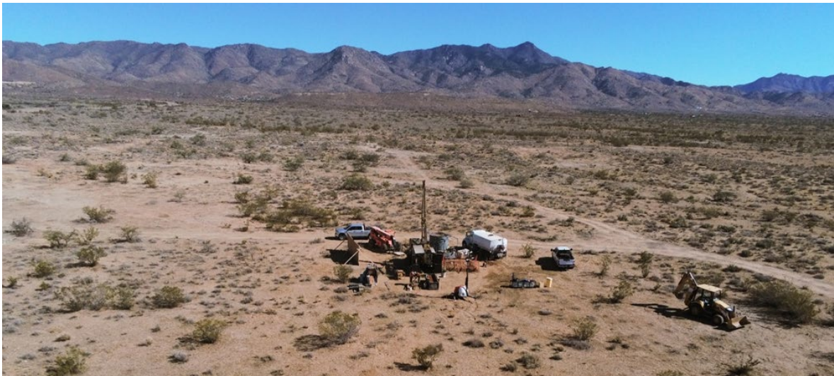
Plate 1 – Diamond Drilling at Tintic zone at Kingman Gold Project, Arizona – November 2022

Drilling focussed on the Tintic area, predominantly targeting the high-grade mineralisation seen in previously announced RC drill holes. The information obtained included grade, geology, structure and mineralogy of the shallow high-grade gold-silver mineralisation.