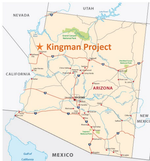
Map 1 – Location of Riedel’s Kingman project in Arizona, USA

The Kingman Project is located in north-west Arizona, USA, approximately 90 minutes’ drive from downtown Las Vegas and within 5km of a major highway (refer Map 1).