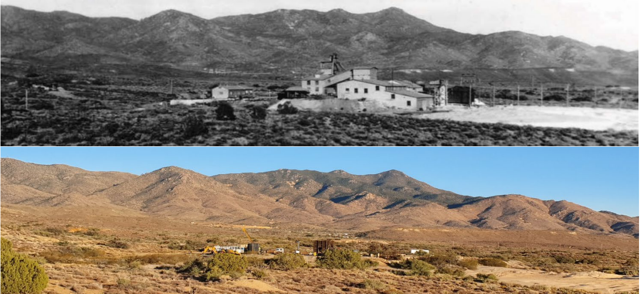
Plate 2 – Kingman Project: Arizona-Magma Mine area (circa 1937 & 2022) with Tintic located just 750m to the South

The Kingman Project was mined predominantly for high-grade gold and silver from the 1880s until the early 1940s - which coincided with the outbreak of WWII. Following limited drilling near Tintic in the 1990s, 11 diamond holes were drilled on the property in late 2019 which intersected multiple zones of high-grade gold, silver and lead from shallow depths, confirming the extensive mineralisation potential of the area (refer Riedel ASX announcement dated 23 October 2020).