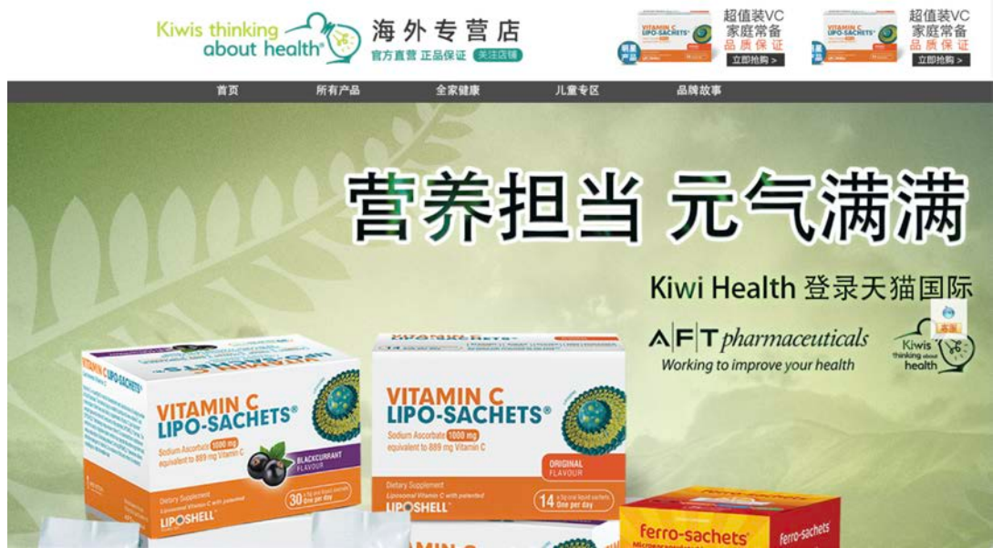
Figure 2: RooLife's New Zealand branded health & pharmacy store – "Kiwi Health"

RooLife Group recognises and thanks its existing shareholders for their support and participation in the Entitlement Offer and welcomes a new group of investors as part of the Shortfall Offer and looks forward to continuing to update shareholders on the Company's progress.