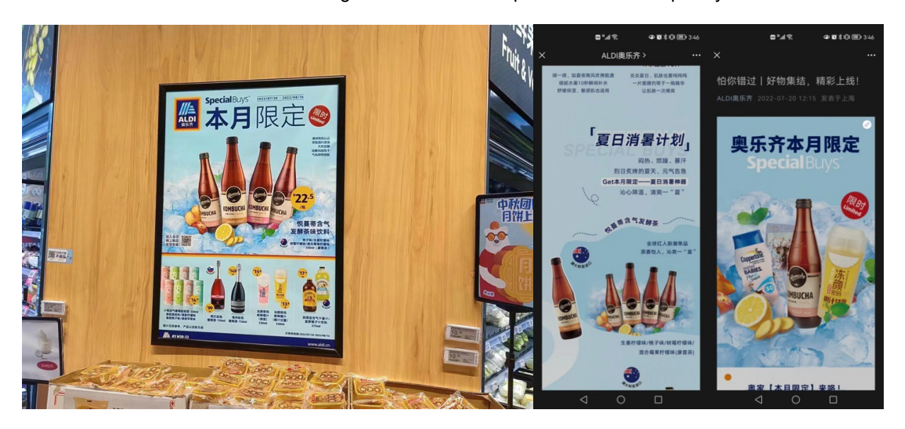
Remedy Drinks launched with ALDI in China

With the placement and marketing with ALDI stores in China this means that Chinese shoppers can not only buy Remedy Drinks kombucha in ALDI stores, but also can easily buy via ALDI's online mini program as well as top Chinese online grocery and delivery platforms of MeiTuan, Ele.me and JD Fresh. This is in addition to sales and distribution through over 100 other supermarket and hospitality outlets.