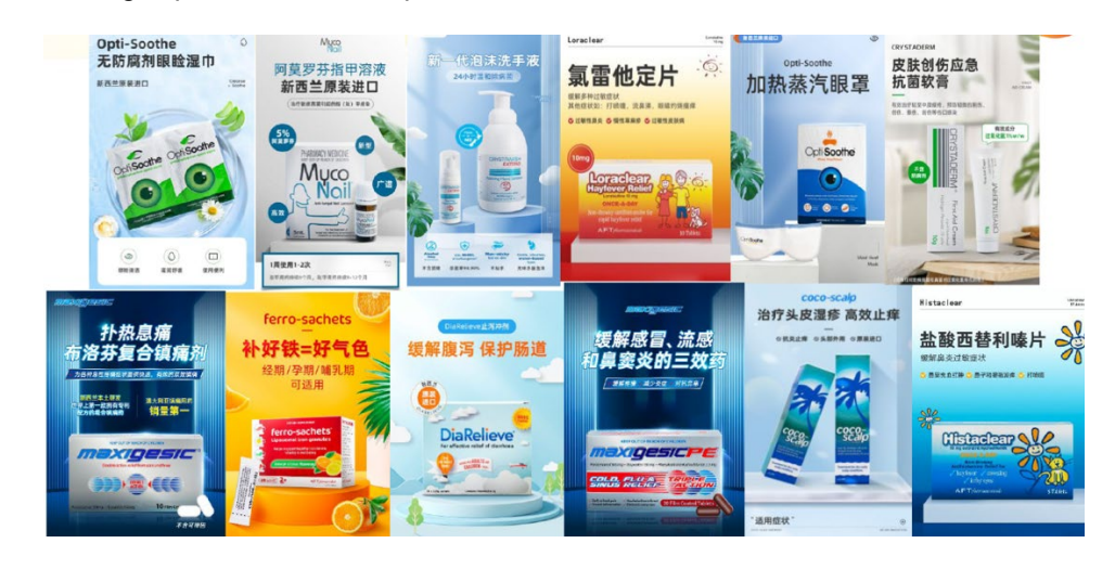
Kiwi Health OTC Tmall Store Launched on Alibaba

Over the last 12 months RLG managed the end-to-end approval process for AFT to sell its OTC (Over The Counter, without prescription) pharmaceutical products directly into China on the RLG-operated Kiwi Health Global Flagship Store', with first products launched for sale this month.