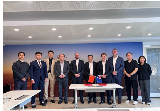
Figure 2: Signing ceremony for solar products and strategic co-operation and distribution

The agreements are for a 10-year term, reflecting the long-term commitment of the parties to the partnership, with a 6-month written notice period for termination which can be mutually agreed. No minimum sales performance is specified.