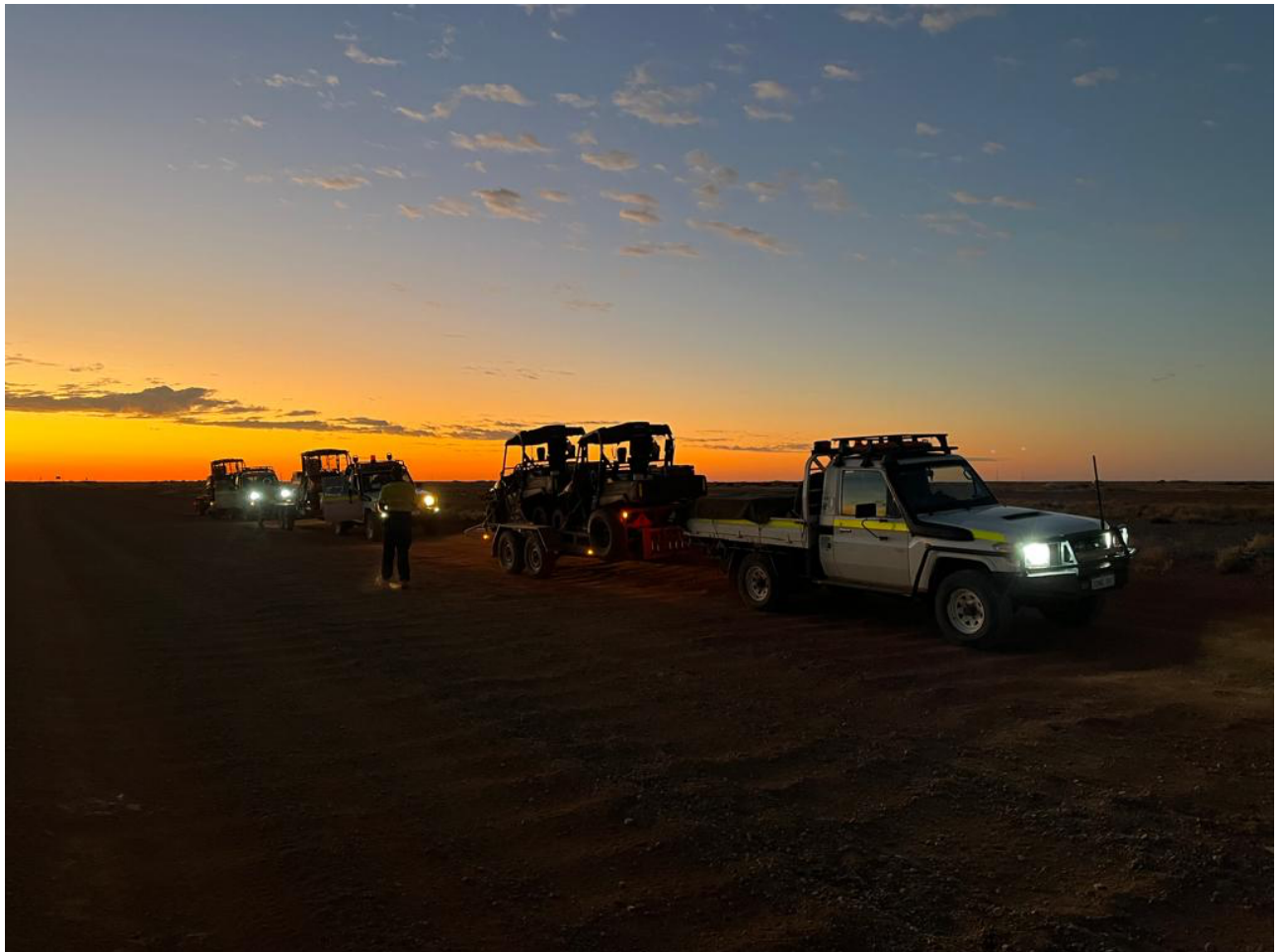
Figure 1 – Atlas Geophysics mobilises to Mabel Creek for the upcoming detailed gravity survey.