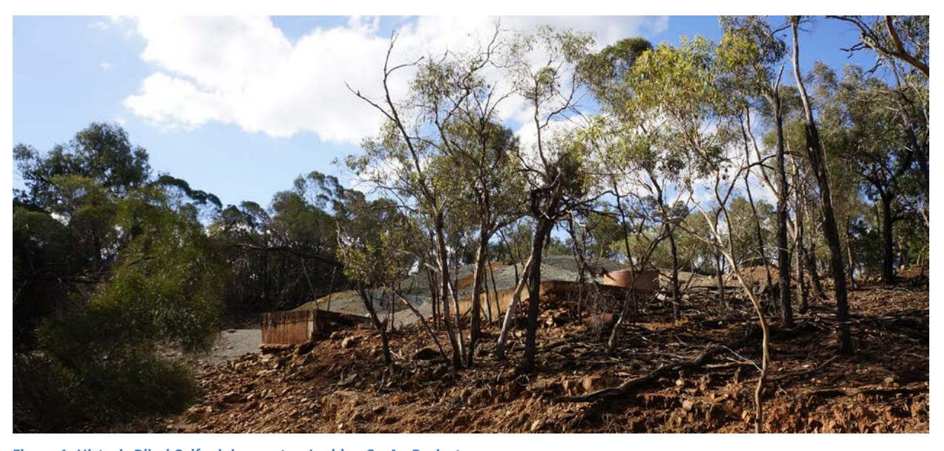
Figure 1: Historic Blind Calf mining centre, Lachlan Cu-Au Project