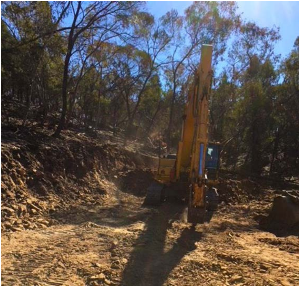
Figure 2: Drill site preparation – Blind Calf Prospect, Lachlan Cu-Au Project

The Blind Calf Prospect comprises a cluster of 13 historic mining shafts developed on a series of shear hosted copper sulphide rich quartz lodes with mapped outcrop strike extents of between 40m to 100m and widths of 5m at surface.