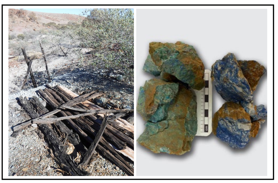
Figure 2: One of several historic copper workings from the 1960s in the project with oxide copper samples.

"The Company's Blue Rock Valley Project is an under explored and highly prospective mineral province, with the potential for high grade discoveries. This region has historic copper-lead-zin & copper working with rock chip samples to 16% Cu adjacent to the Talga shear zone. We are pleased that the survey has located late time bedrock conductors, especially combined with other influencing factors like geological control or geochemistry. We are looking forward to progressing these anomalies with ground EM surveys in the near future while we patiently await the return of the VTEM system to test our other highly desirable copper assets at Station Creek and Mt Boggola in four to five weeks".