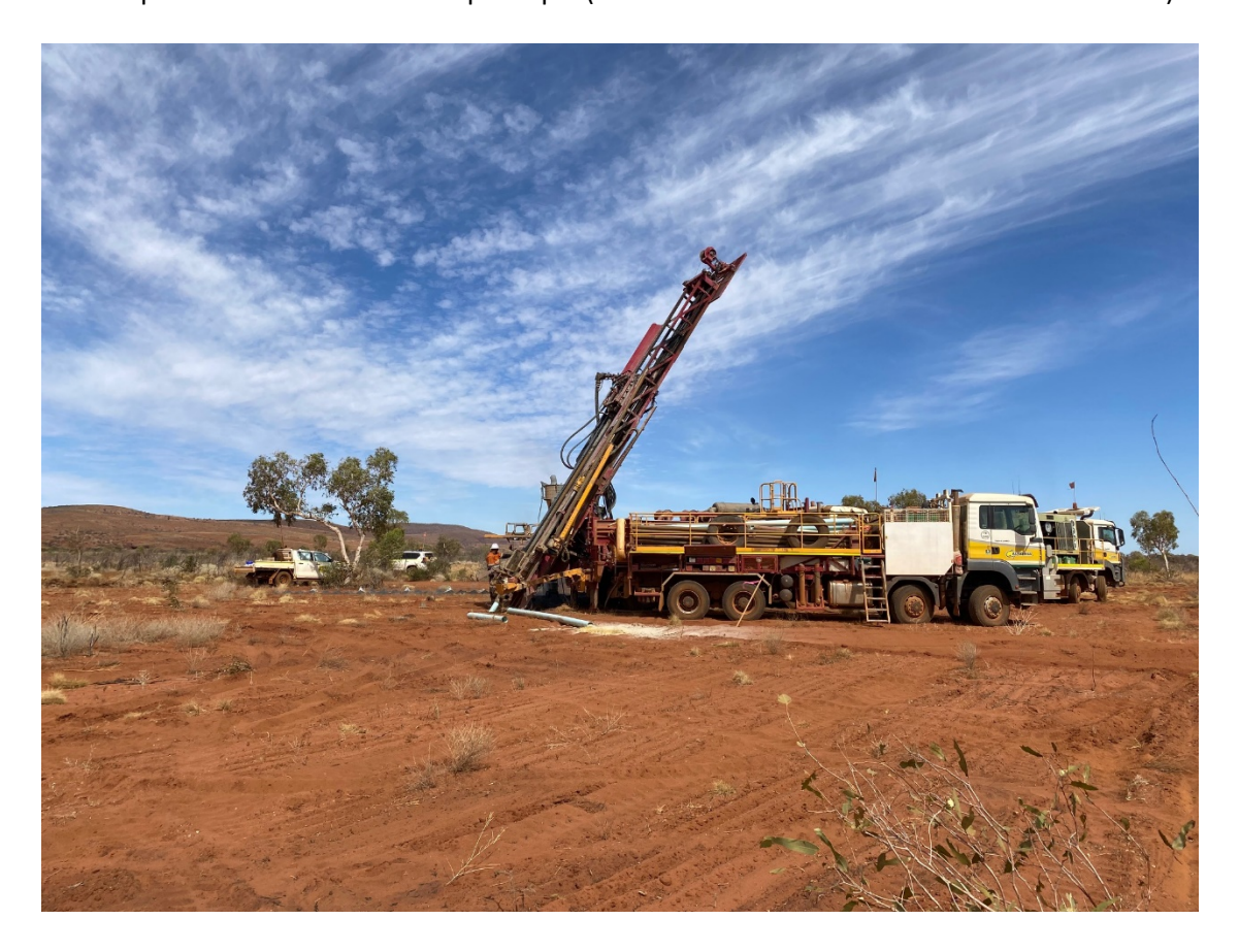
Image 1: Maiden RC drilling at the Blue Rock Valley Copper Project (Target 1).

Target 2 comprises of three overlapping EM anomalies at the historic Blue Rock copper shafts which recently returned an impressive 49.9% Cu rock-chip sample (refer to ASX announcement 13<sup>th</sup> October 2021).