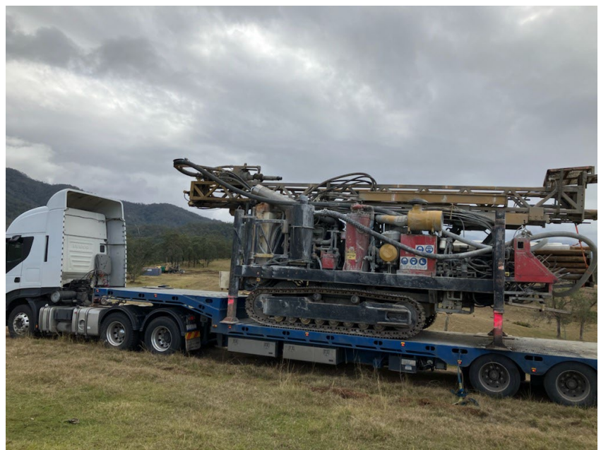
Image 1: Jackadgery – Track mounted RC rig arrives at Jackadgery mining area.

The Jackadgery Gold Project is located between Glen Innes and Grafton in northern New South Wales within the New England Orogen (Figure 1). A track mounted reverse circulation (RC) drill rig (Image 1) has arrived and commenced drilling. All drill sites for this maiden drilling campaign have been designed to test the historic John Bull gold shafts (1880's), the main gold sluiced area (1940's) and the historic surface trench (1980's by Kennecott Exploration (Australia) and Southern Goldfields Ltd) that contains an untested mineralised interval of 160m @ 1.2 g/t Au.