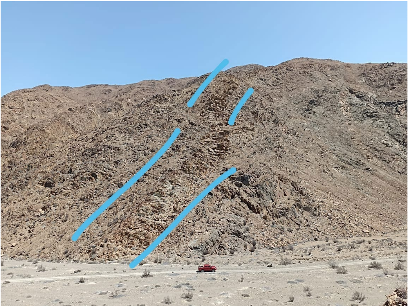
Figure 2 – an approximate 15m wide El Zorro Tonalite intrusive dyke (contacts in blue), within the new concession area looking south at approximately 7040200 mN 341400 mE, approximately 5km north of the Ternerera Gold Deposit. PSAD56/19S datum.