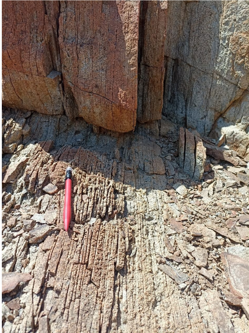
Figure 3 – El Zorro Tonalite outcrop at approximately 7040200 mN 341400 mE, approximately 5km north of the Ternera Gold Deposit, cross-cut by intense sheeted veining of quartz and oxidised sulphide minerals, typical of gold bearing intrusive at the El Zorro Gold Project. PSAD56/19S datum.

Authorised by the Board of Tesoro Resources Limited.