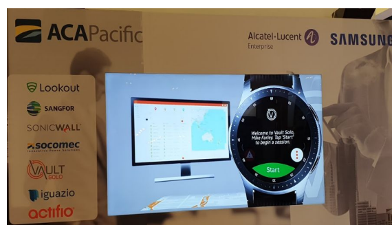
“Solo hosted by ACA / Samsung at Government Technology Expo in Singapore 18-20 September”