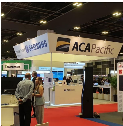
"ACA Pacific Display - Singapore"

• ACA Pacific have a close relationship with Samsung and have jointly hosted and promoted Solo at the Government Technology Expo in Singapore 18-20 September combining the new Samsung Galaxy watch and Solo and targeted at generating B2B sales. Solo was featured in keynote presentations by Samsung.