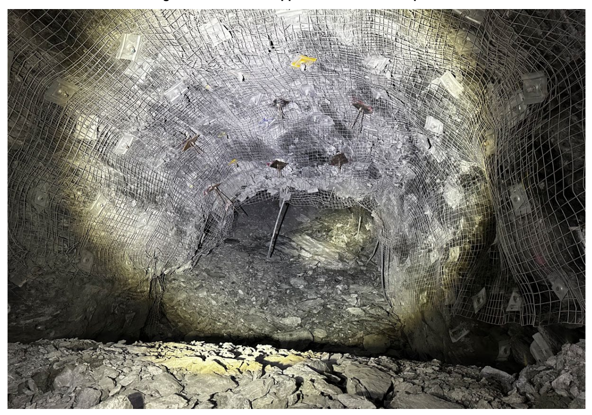
Figure 4 – Woodlawn 2390 P1 Stope Brow