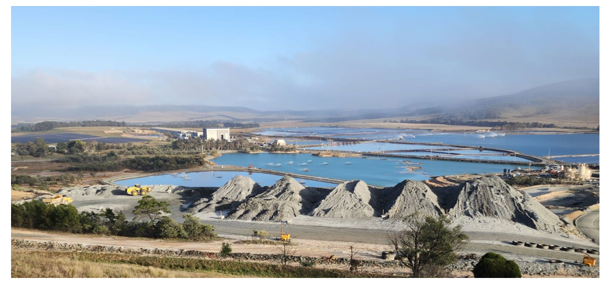
Figure 1 - Woodlawn Mine ROM pad ore stockpiles

The site team focus is on completing commissioning activities and ramping-up the processing plant to 850,000 tonnes per annum, which is expected to be achieved in the December quarter of 2025.