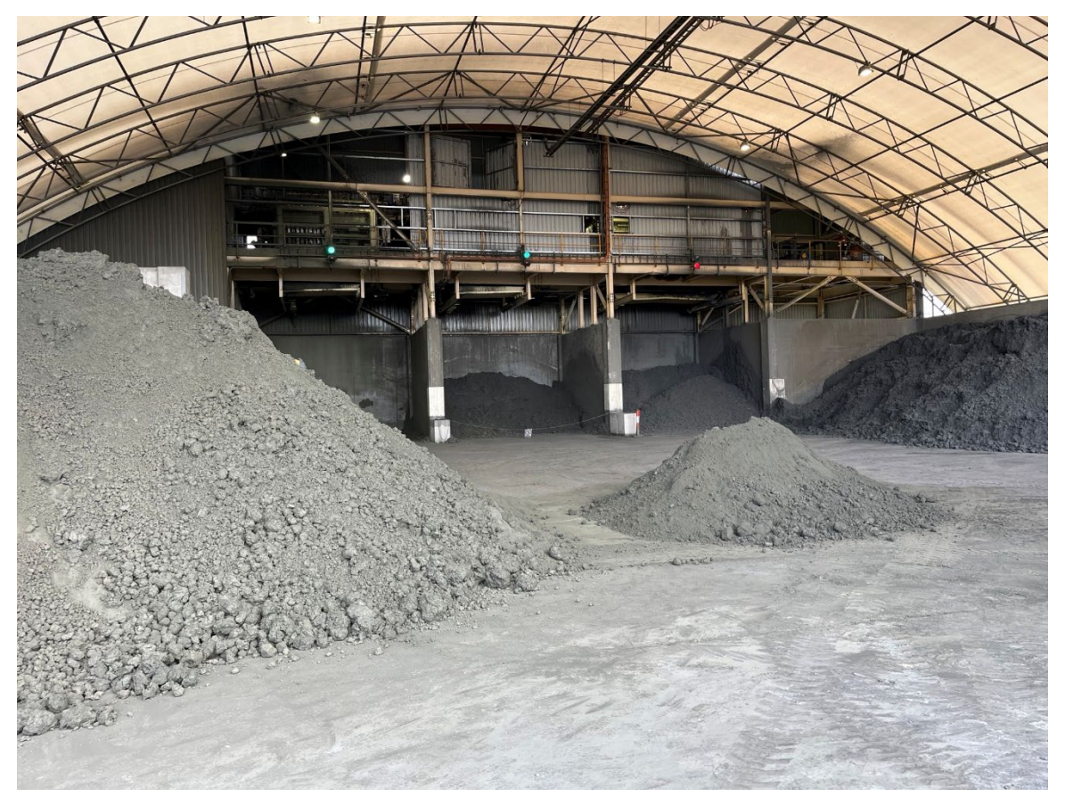
Figure 3 Woodlawn copper concentrate stockpiles