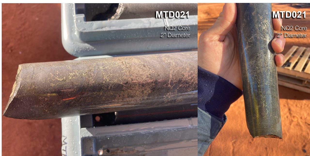
Figure 2A and 2B: Photos showing examples of visible sulphides in hole MTD021

Note: core is NQ2 being 2 inches or 50mm diameter