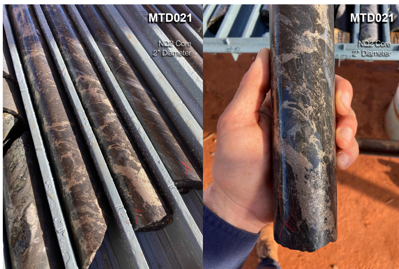
Figure 1A and 1B: Photos showing examples of visible sulphides in hole MTD021

Significant banded sulphides (25-35% sulphide, pyrite-pyrrhotite-chalcocopyrite) was seen within the black shale units. Whilst these sulphides likely explain the modelled up-dip component of the high conductance EM anomaly in this area, they were encountered at much shallower depths than anticipated. The hole did not test the main core of the modelled NW3 Conductor (~1,000m x 1,000m, 5,000S - 8,000S conductance) so this sulphide-rich unit may extend for considerable strike and depth.