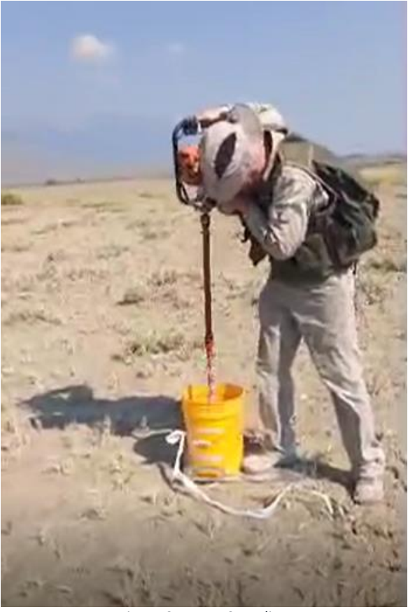
Figure 3: Auger Sampling