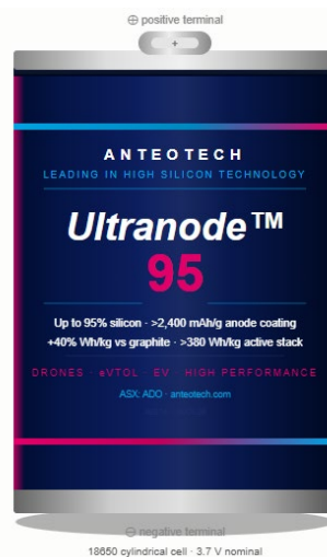
Figure 3: Illustrative representation of Ultranode™ 95 cylindrical cell format

Figure 4 below illustrates where AnteoTech is heading in its commercial scale up and validation program with BIC. Further updates on progress will be provided when available.