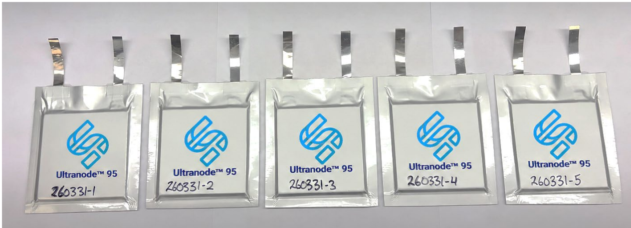
Figure 1: MLPs with Ultranode™ 95 anodes assembled for testing at BIC

Figure 2 below shows the results achieved at BIC for the cells in Figure 1, showing validation of Ultranode™ 95 in 5 Ah Multi-Layer Pouch cells