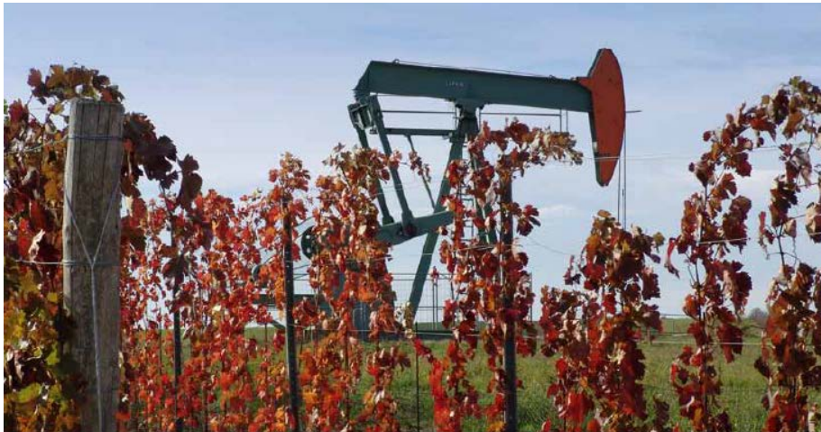
Figure1: Zistersdorf Field production well within vineyards

As announced on 2 July 2019, ADX entered into binding agreements with REP on the 1 st of July 2019 for the acquisition of RAG Production Assets as well as RAG Exploration Data which includes exclusive access to 3D seismic, 2D seismic, drilling data and geological data (including 3650 km 2 of modern 3D seismic) over soon to be available for licensing exploration areas proximal to RAG's main production assets in upper Austria. In addition to the RAG Exploration agreements, ADX has entered into access and tariff arrangements with RAG for production infrastructure in the Molasse Basin. ( See Acquisition overview )