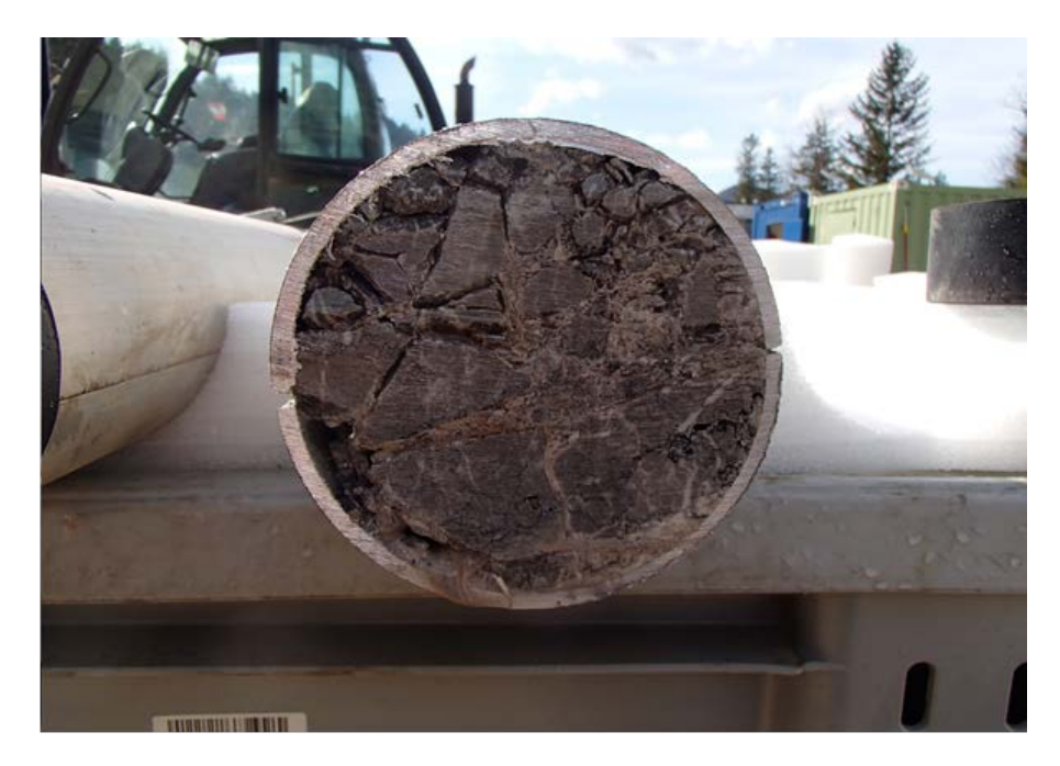
Figure 1: Image of the cut section of recovered core showing the presence of a natural fracture system which is essential for gas production performance