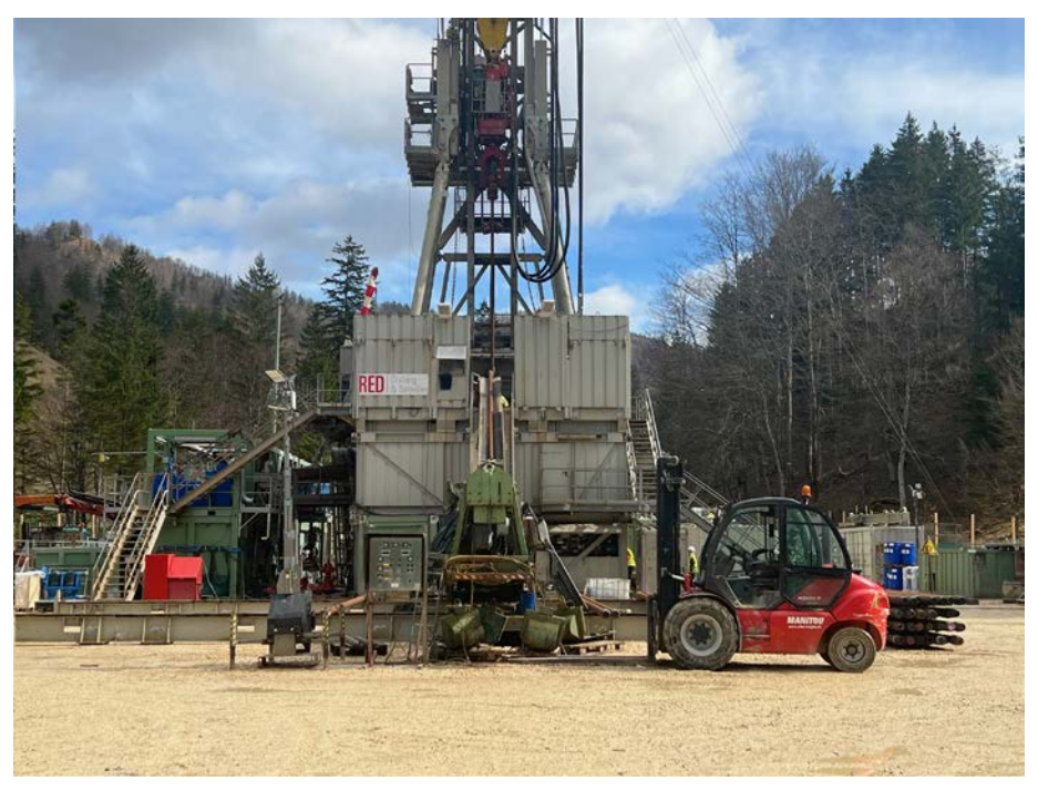
The RED Drilling & Services GmbH (RED) E200 drill rig drilling at Welchau

The Welchau-1 gas exploration well is targeting the mid Triassic age Steinalm Formation in which gas was discovered at the nearby Molln-1 well. The expected total drill depth is between 1500 metres to 1900 metres measured depth (MD). The main target depth is between 1100 metres and 1800 metres measured depth. The success case drilling and evaluation program is anticipated to take between 34 to 39 days from the spud date.