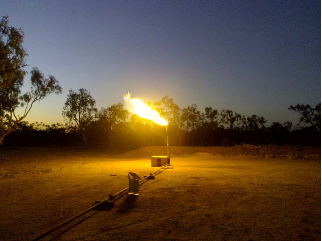
Figure 2: Flare from Armour's Egilabria 2 Well Discovery – 8 October 2014