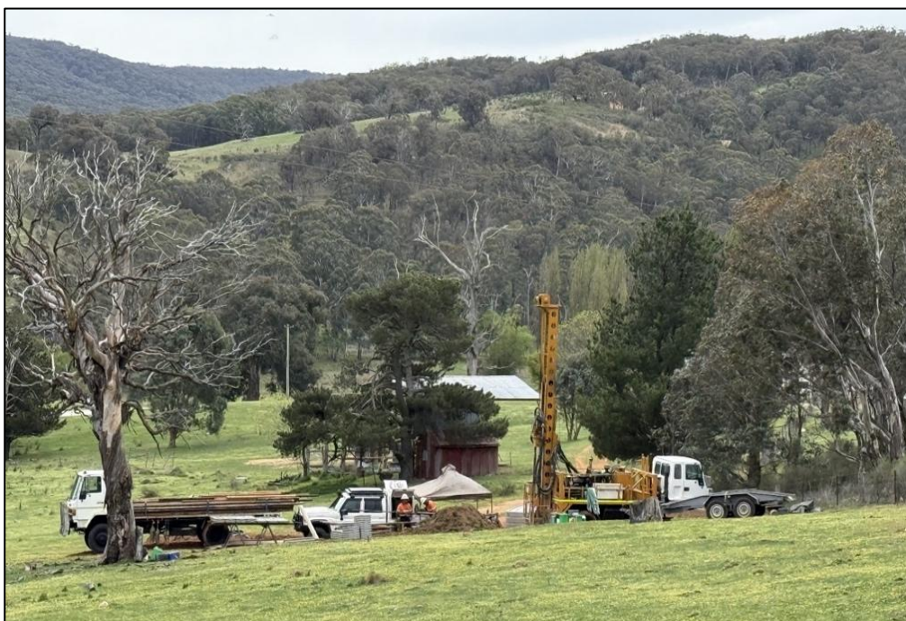
Figure 1 – Diamond drill rig at Argent’s wholly owned Kempfield Polymetallic Project

Argent Minerals would like to thank Orange-based drilling contract Chief Drilling Pty Ltd for the safe and successful diamond drilling program.