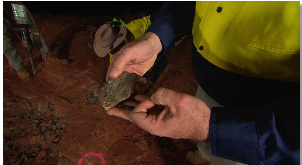
Figure 1: One of the Watermelon shaped gold pieces recovered from Purdy's Reward while live streamed to the Denver Gold Forum.