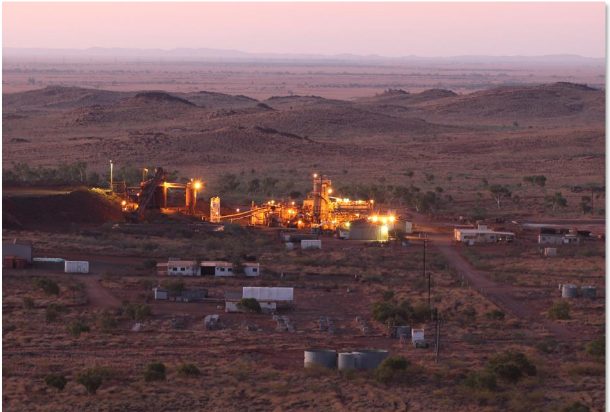
Figure 2: Radio Hill Plant at dusk on Saturday 25 November 2017.

The Company and its contractors are working towards having the plant fully operational as a multi-metals processing facility by end of June 2018.