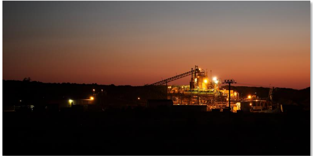
Figure 1: The lights go back on at Radio Hill on 25 November 2017.