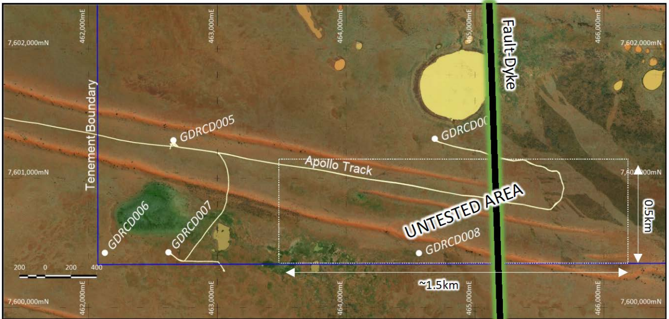
Figure 2: Drill hole locations with interpreted major regional fault with later infill dyke. Untested Apollo/Atlas area in yellow (~1,5km X ~0.5km). Note GDRCD008 hole lost still in cover sequence at ~241m still well short of target.