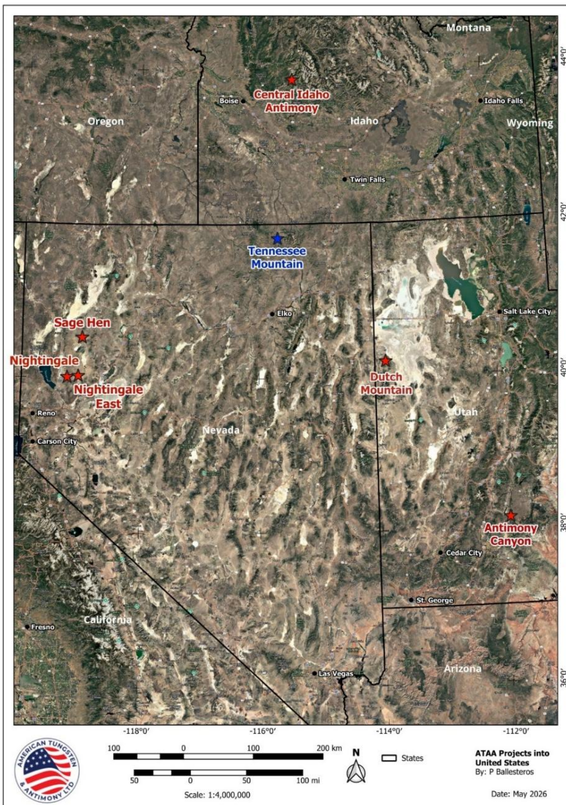
Figure 5 – Location map of the Southwestern USA highlighting American Tungsten and Antimony Projects including the Tennessee Mountain Project in Elko County, Nevada.