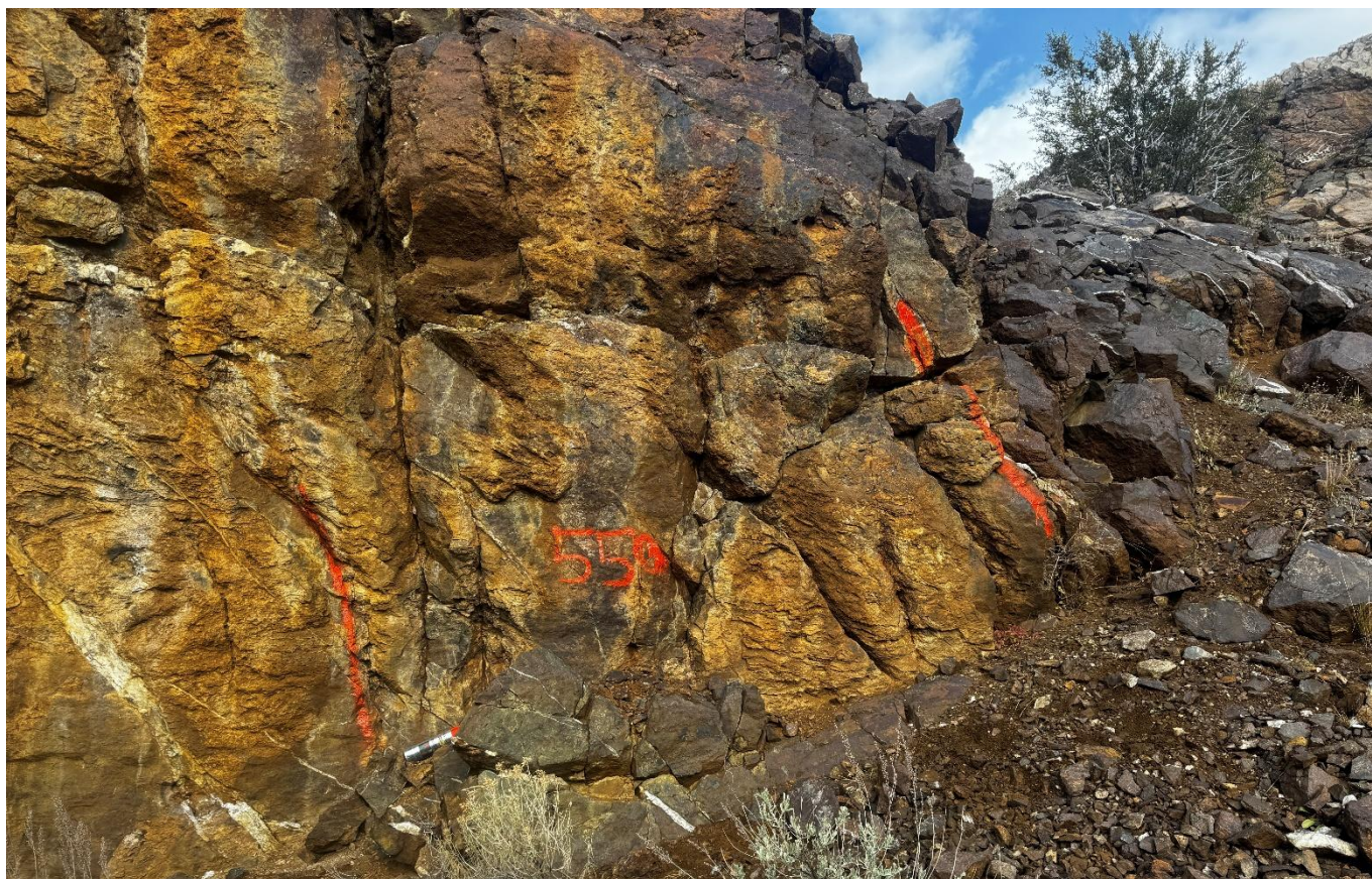
Figure 3 – Channel sample ID 1080550 of limestone skarn that returned 4,191 ppm W from the northern section of the historic Garnet Mine, Alder Mining District, Elko County, Nevada. Five (5) holes are designed to test the immediate area.