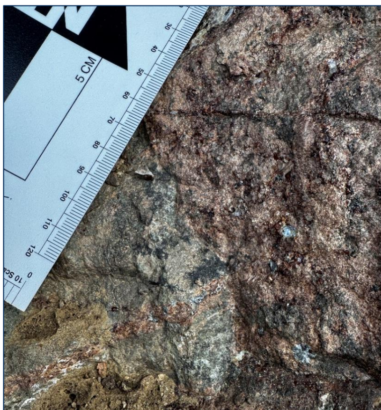
Figure 4 – Rock chip sample 1939349 in Skarn contact zone, returned 2% (20,693 ppm) of Mo.