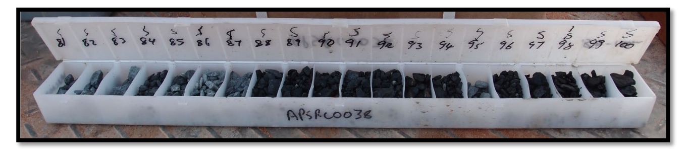
Photo 2: Chip tray from hole APSRC0038 depth 80-100m showing sulphides in a basaltic unit in each one metre interval. Note the colour changes from leucocratic depths 81-83, 86-87 and 95 to melanocratic phases and the 1% sulphide content at 98m.