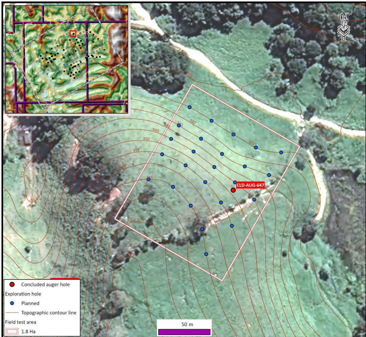
Figure 1. Woolrich Deposit First Wellfield Field Trial Area.