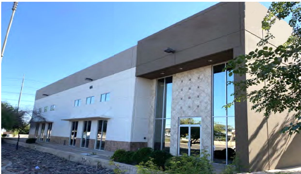
Figure 3 – Entrance to Lithium Research Centre

This ASX announcement is authorised for release by the Board.