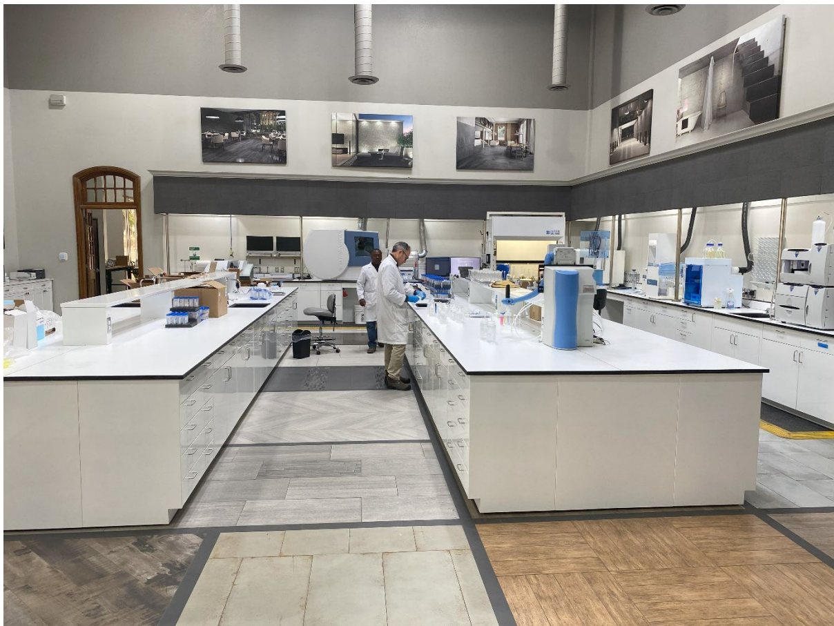
Figure 1 – Arizona Lithium Research Staff Testing in the Laboratory