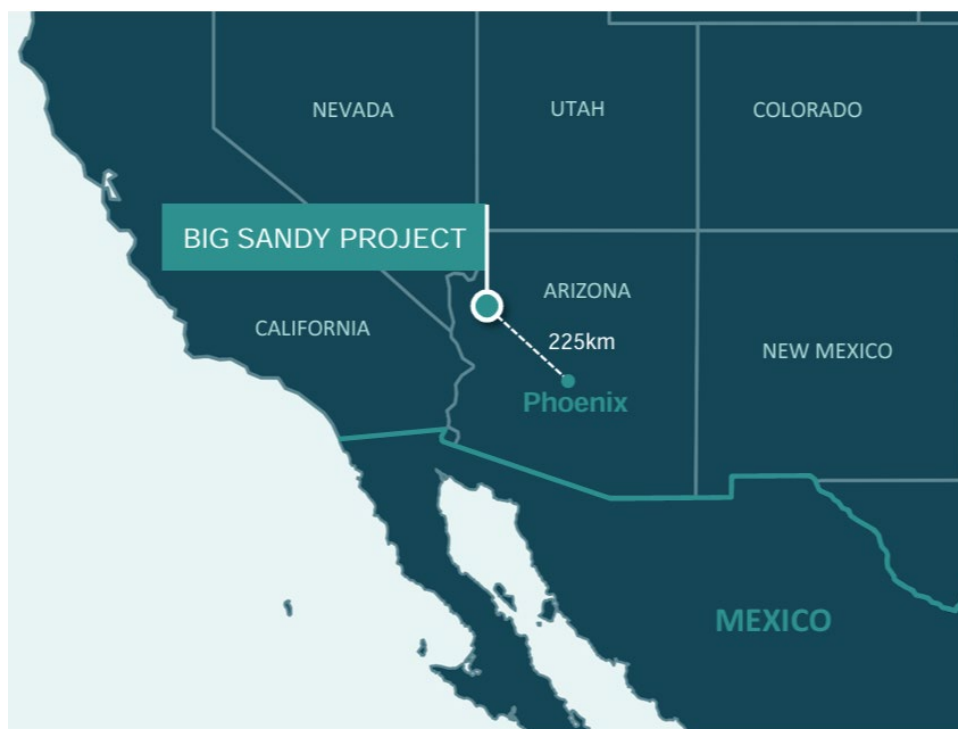
Figure 4 – Location of the Big Sandy Lithium Project, Arizona, USA.

The Company is in the process of evaluating in detail the implications of the court's decision and its next steps and will update the market as required.