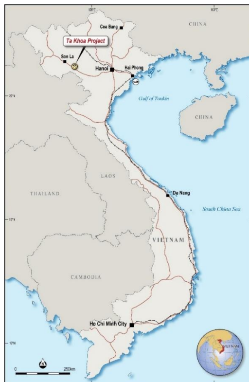
Figure 1: Ta Khoa Nickel-Cu-PGE Project location

Blackstone Minerals delivered a Maiden Resource in Q3, focused initially on the DSS at Ban Phuc and continues to investigate the potential to restart the existing Ban Phuc concentrator through focused exploration on both MSV and DSS deposits. Blackstone delivered a Scoping Study on the downstream processing facility at Ta Khoa. The Scoping Study provided details for joint venture partners to formalise the next stage of investment.