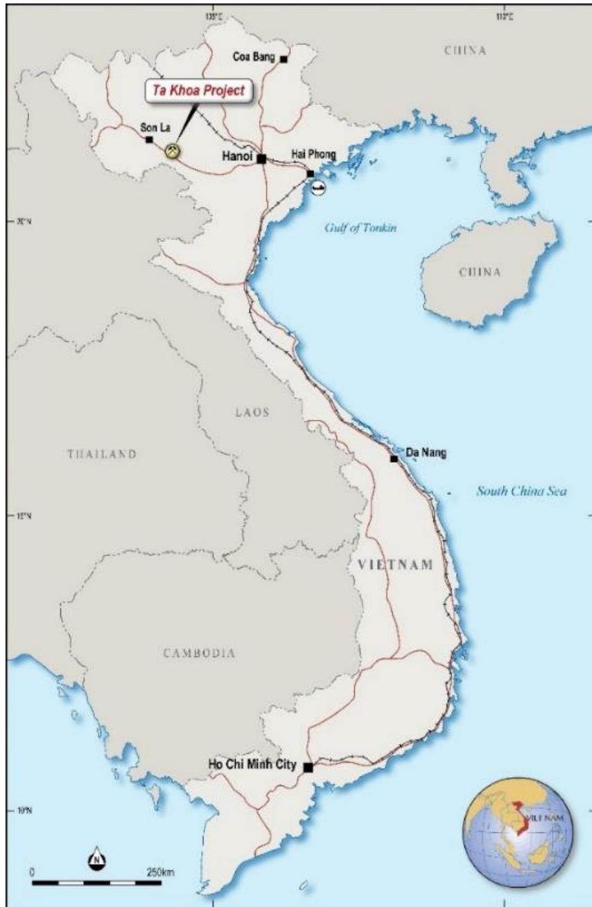
Figure 3. Ta Khoa Nickel-Cu-PGE Project Location