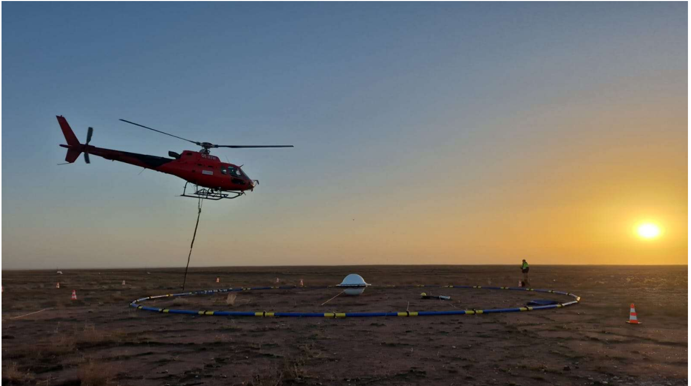
Figure 2 – Survey helicopter and Electromagnetic loop during survey testing

This announcement has been authorised by the Board of C29 Metals Limited.